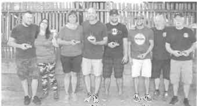
Left to right: winners of 4th, 1st, 2nd and 3rd place